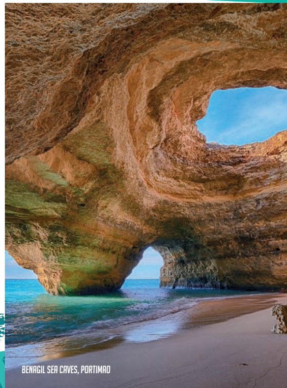
BENAGIL SEA CAVES, PORTIMAO